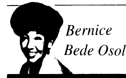
Bernice Bede Osol

VIRGO (Aug. 23-Sept. 22) If you do not believe in your leadership abilities today,